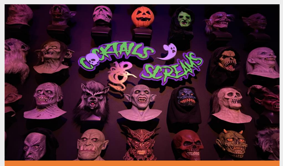
Cocktails & Screams

EXPLORE an electrifying bar experience in the heart of Orlando! ENABLE yourself to experience a thrilling fusion of spine-tingling excitement and tantalizing libations. As you step into this macabre wonderland, you'll be enveloped by an atmosphere that is equal parts eerie and enchanting.